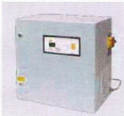
System control Klaro Easy

The GRAF SBR wastewater treatment system Klaro Easy works according to the principle of SBR lifting technology. No live parts need to be installed in the tank. All movement processes are performed by three air lift pumps, which are operated using a compressor. The compressor also provides the plate ventilator on the bottom of the SBR reservoir with air. The compressor and all other technical components are low maintenance and stored in a switch cabinet, which can be installed in the plant room of the house.